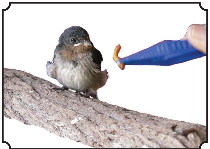
Photo: A young Tree Martin enjoys a meal worm. Martins catch prey on the wing.